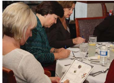
Luncheon attendees test their knowledge around substance abuse trends